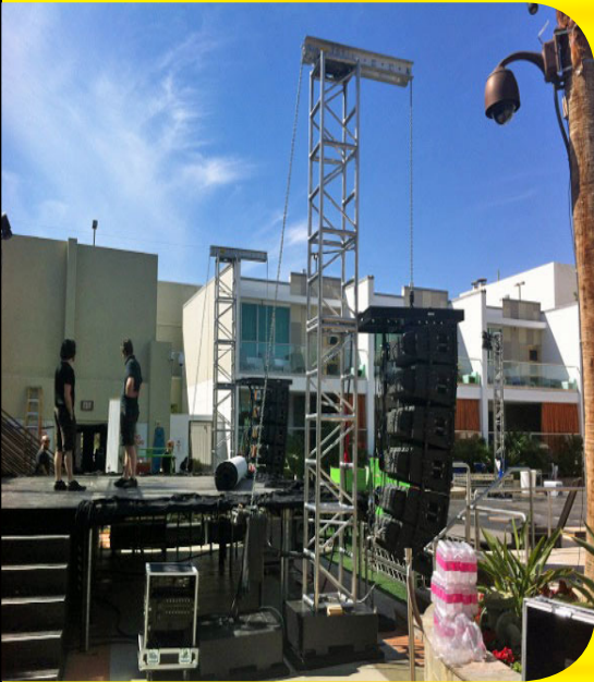
Tower is 16' High Speakers weigh approx. 800 LBS

Outdoor stage and sound system doesn't need the whole world. Just two base plate weights provides your foundation with plenty of room left for the other needs.